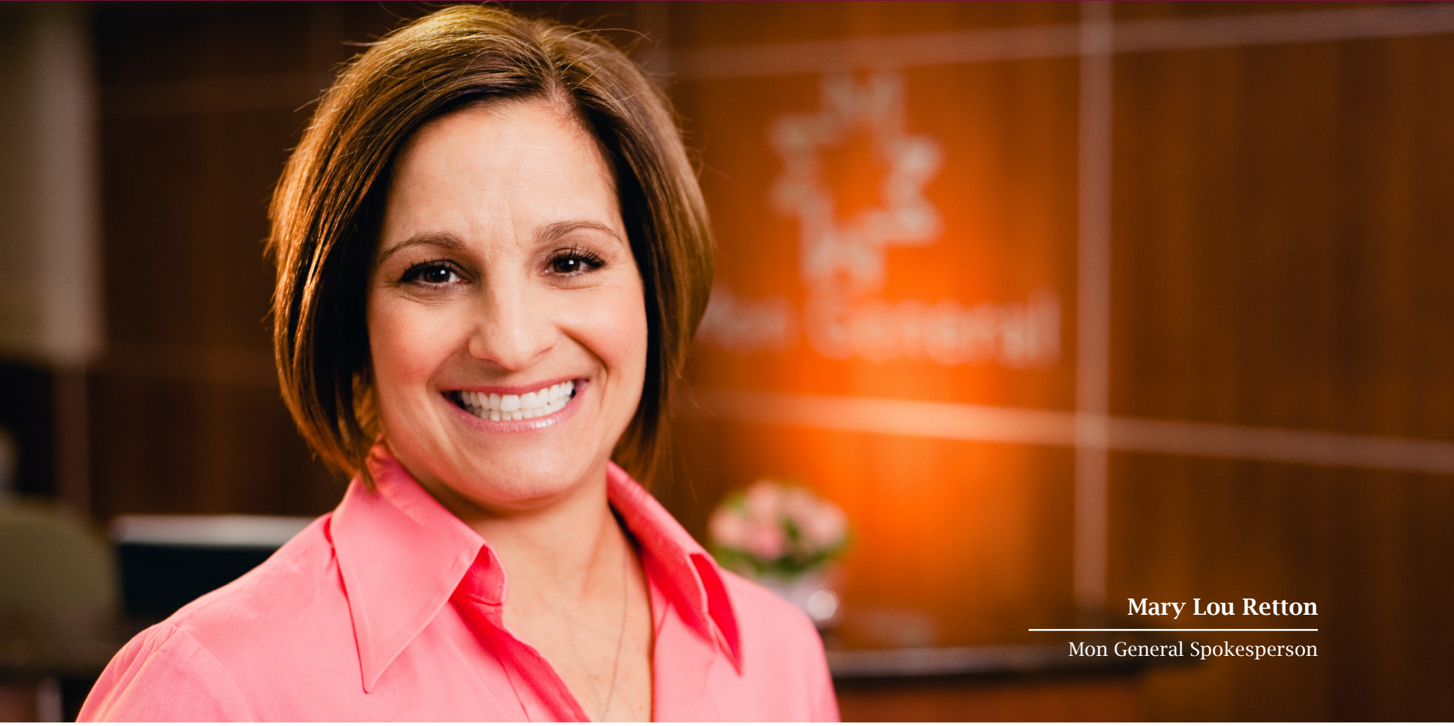
Mary Lou Retton